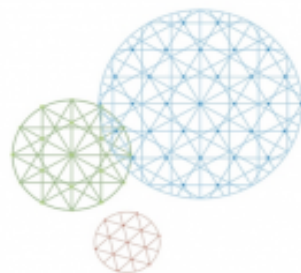
The Eco-Patent Commons

The Eco-Patent Commons is probably the most illustrative collective attempt to foster green technology transfers that has been launched so far. IBM, Nokia, Pitney Bowes and Sony in collaboration with the World Business Council for Sustainable Development created in 2008 a platform gathering patents addressing a wide range of sustainability issues